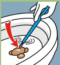
Gently brush the surface of the stool from the first bowel movement for about 5 seconds