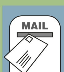
Mail or return completed test card