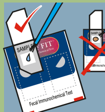
Apply TOILET WATER SAMPLE from first stool to test card