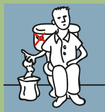
Use one of the provided waste bags for the used toilet tissue