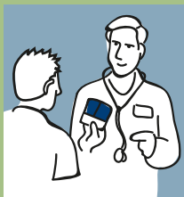
Receive InSure® FIT™ from your physician

One of the most common cancers is now easier to detect.